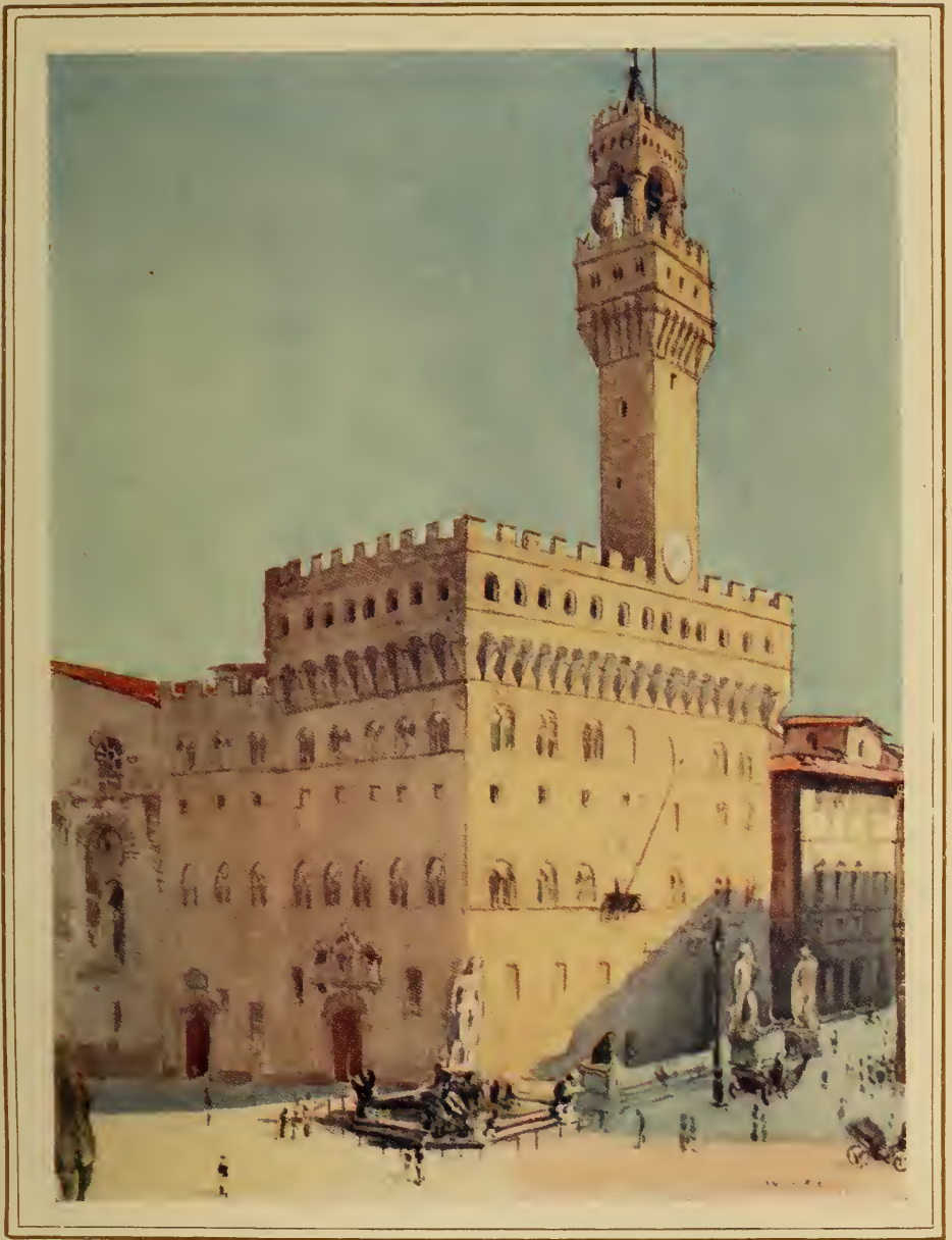
THE PALAZZO VECCHIO